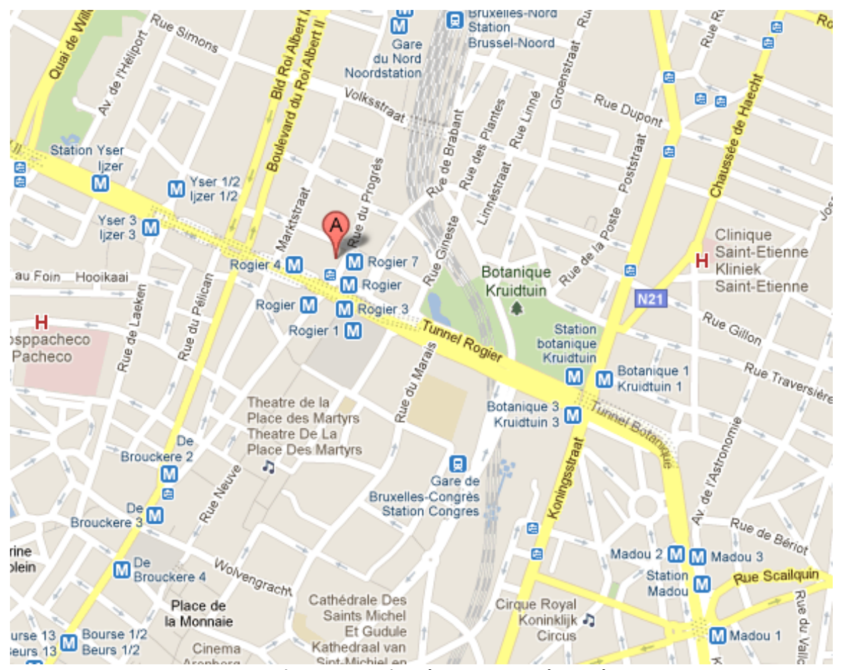
Figure 1: Location Sheraton Brussels Hotel

Metro station: Rogier (metro lines 2 and 6)